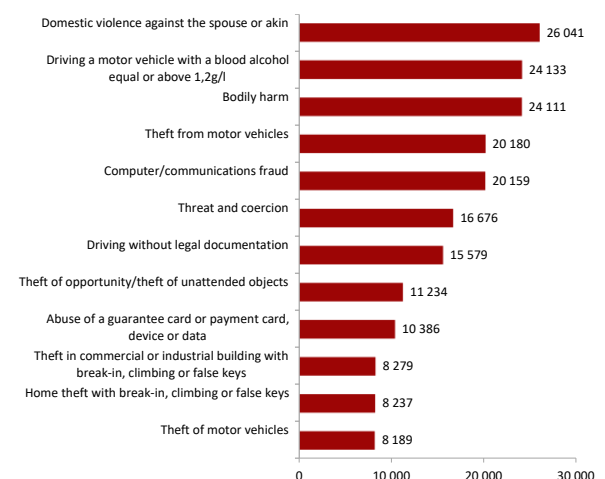
Table 2 - Some crimes recorded by police authorities, in 2023

Table 2 highlights some of the most frequent crime categories, among which is the crime of "domestic violence against spouses or akin" with 26,041 crimes and the crime of "driving a motor vehicle with a blood alcohol equal or above 1,2g/l" with 24,133 crimes. 2